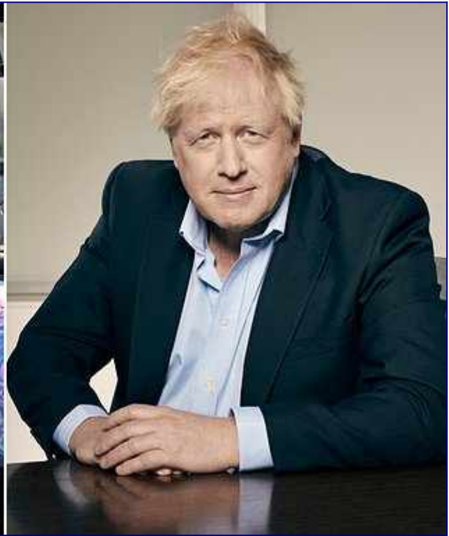
BORIS JOHNSON: Hair-raising Tesla ride shows driverless cars are future 2.4k viewing now